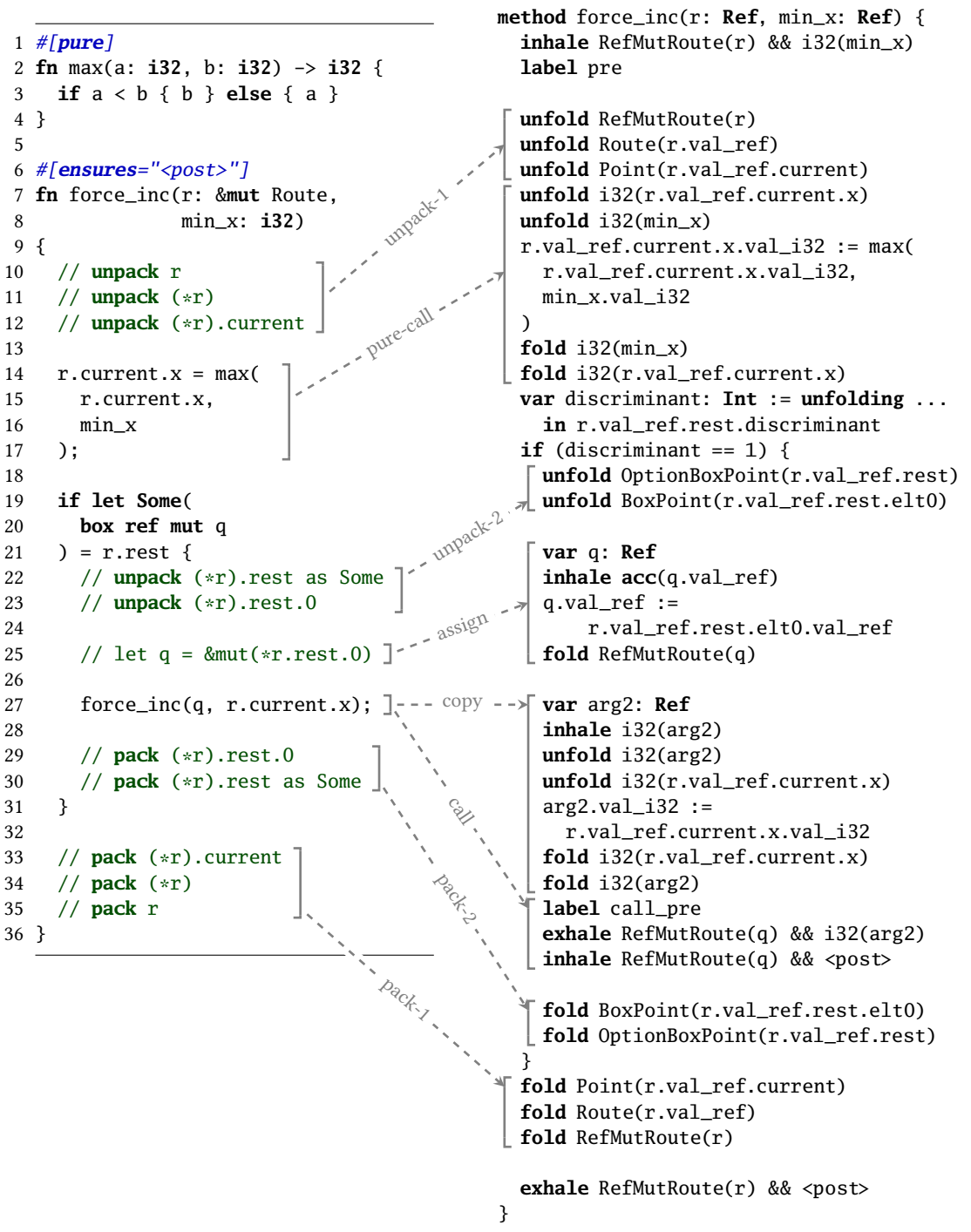
Fig. 7. An encoding of force_inc to Viper. The function is augmented with pack and unpack operations, and is then translated to the Viper method shown on the right. The encoding of the postcondition <post> is in Fig. 9. Note that Rust implicitly dereferences r when accessing its fields.