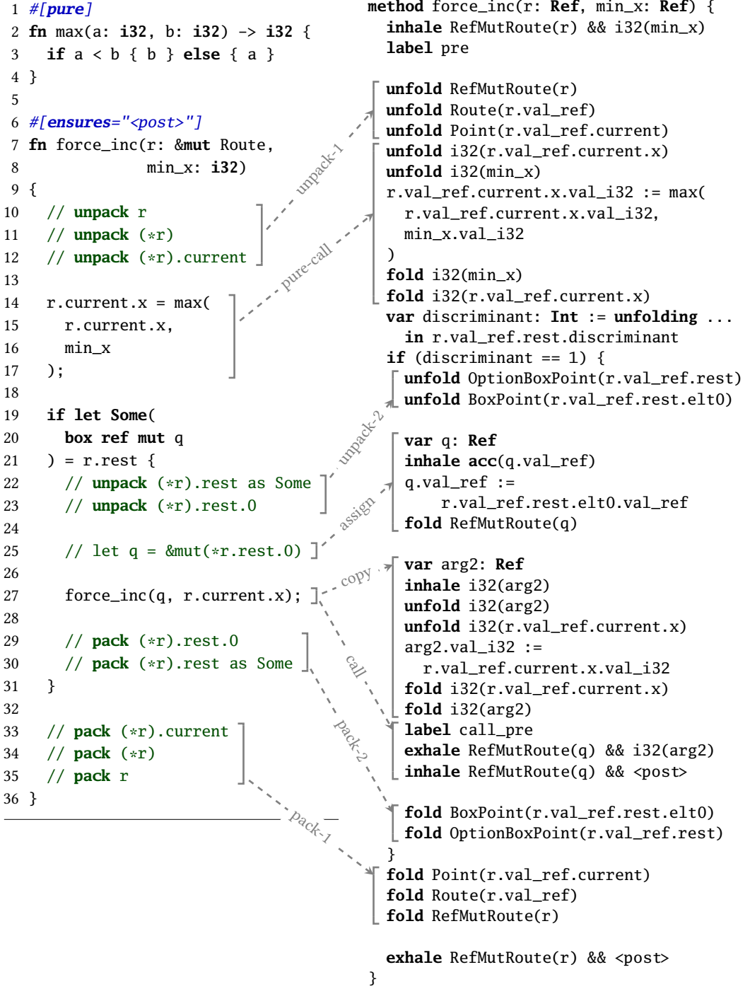
Fig. 7. An encoding of force_inc to Viper. The function is augmented with pack and unpack operations, and is then translated to the Viper method shown on the right. The encoding of the postcondition <post> is provided in App. A of our technical report [Astrauskas et al. 2019b]. Note that Rust implicitly dereferences r when accessing its fields.